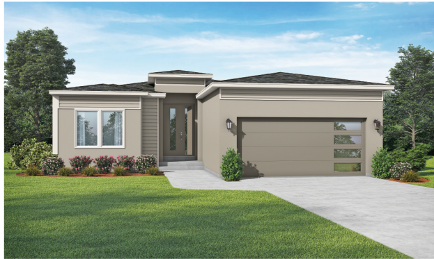
MID-CENTURY COLORADO elevation E