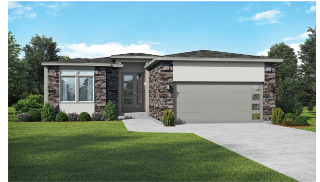
ECLECTIC PLAINS elevation F