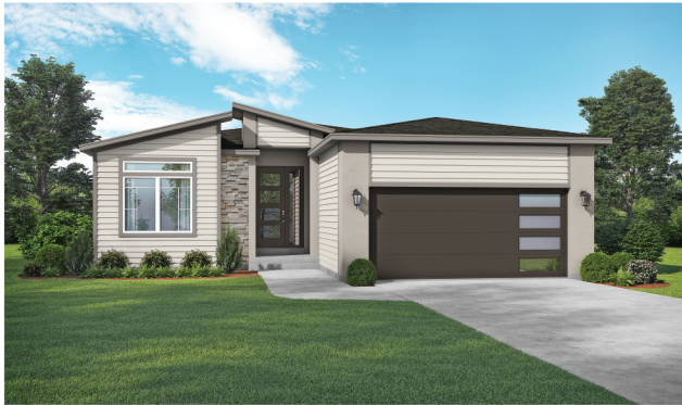
MODERN DESERT elevation D