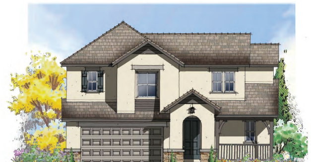
FRENCH COUNTRY elevation C