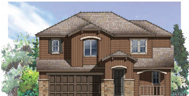
BEAVER CREEK elevation A