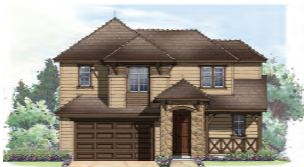
NORTHERN EUROPEAN elevation B