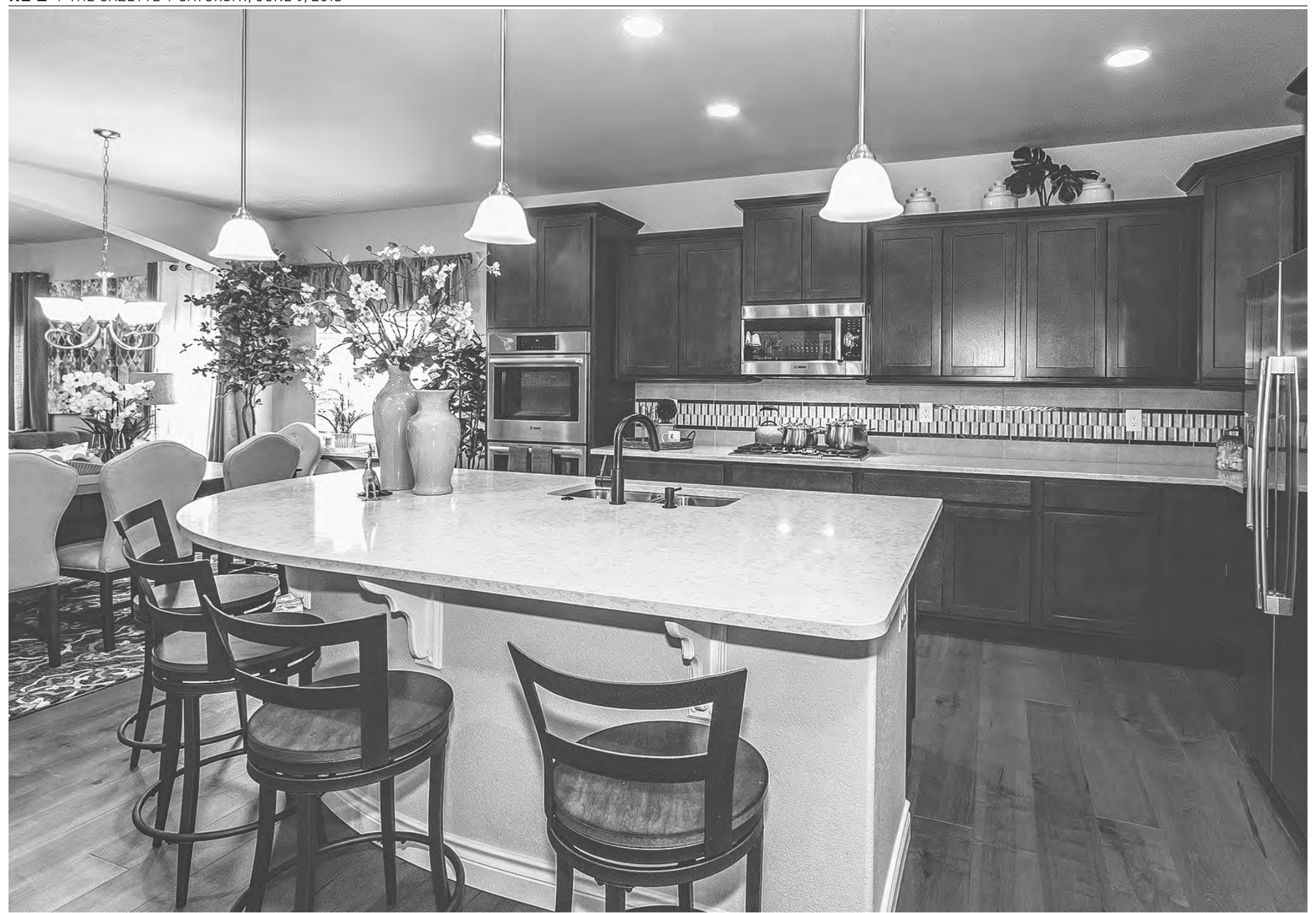
The house will be open to the public Saturdays from 9 a.m. to 5 p.m. and Sundays from noon to 5 p.m. through June 10.