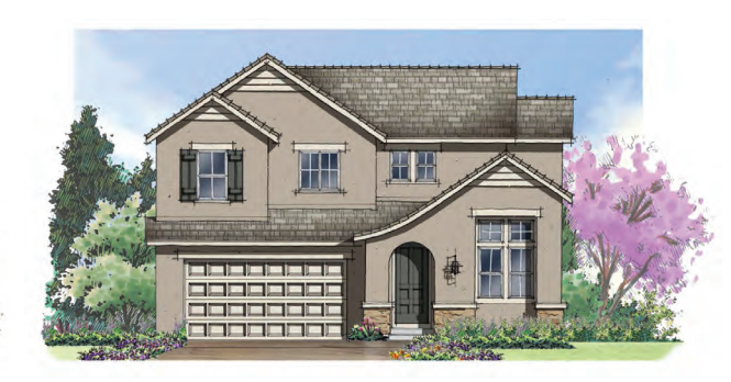
BEAVER CREEK elevation A