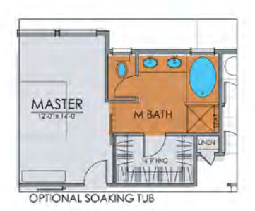
OPT 5 PIECE BATH

The Marseille - Plan 543 Two Story Traditional 2,121 - 3,147 Finished Square Feet 2,984 - 3,224 Total Square Feet 3-7 Bedroom 2.5 - 3.5 Baths Open floor plan, fabulous kitchen, optional covered patio, and covered porch